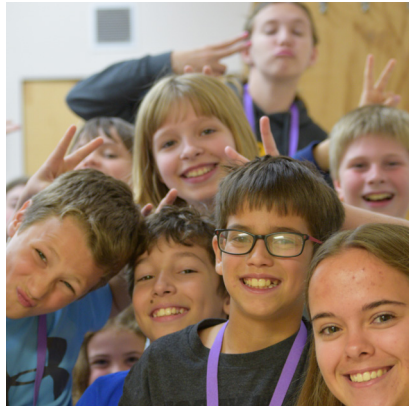
Vacation Bible School (Jun)