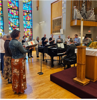
Y'all Come Choir