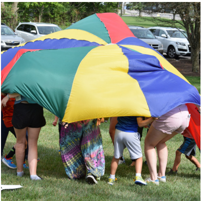
Church Picnic (Aug)