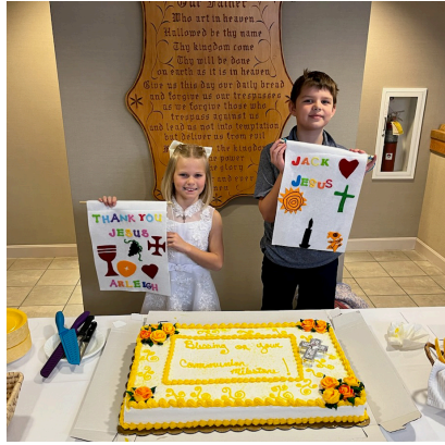
Communion Milestone (Mar)