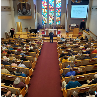
Congregational Meeting (Jan)