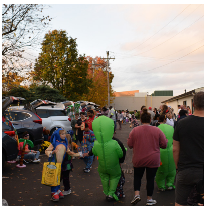
Trunk or Treat (Oct)