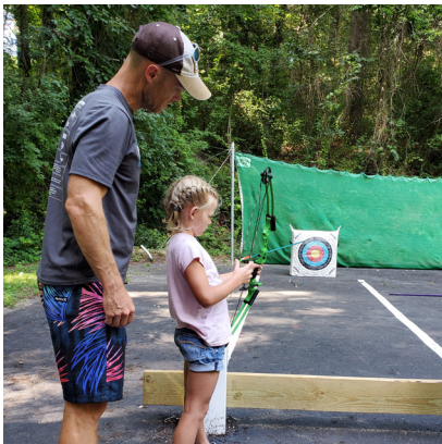
Summer Camp (Jul)