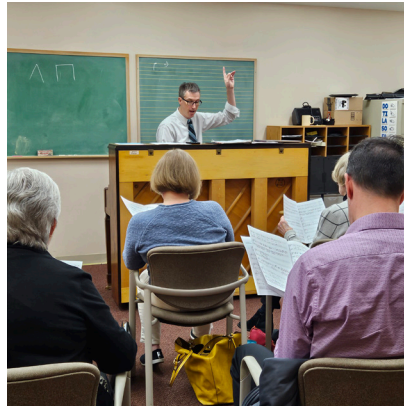
Victory Singer's Practice