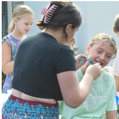
Rally Day (Sep)