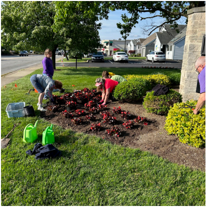
Botanical Bunch Planting (May)