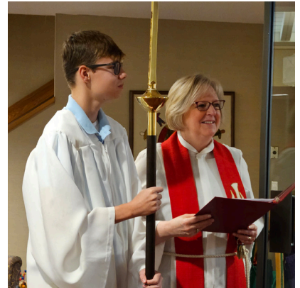
Rite of Confirmation