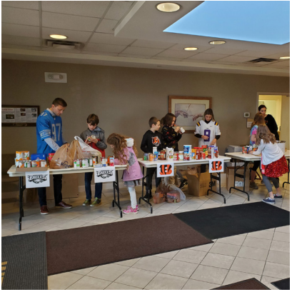
Souper Bowl of Caring (Feb)