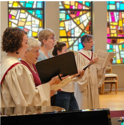
Chancel Choir Practice