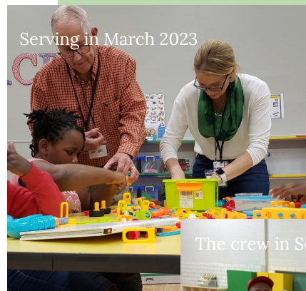
Serving in March 2023