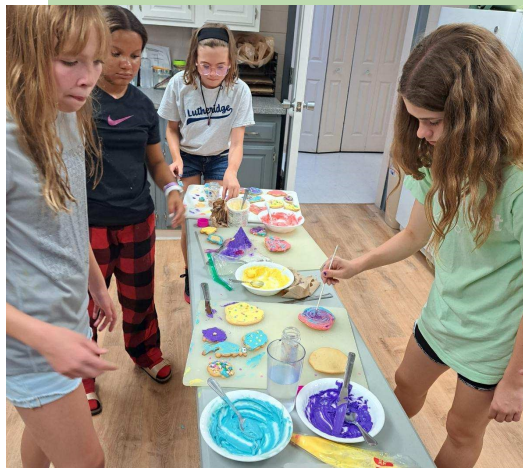
Confirmation Overnight (July 2023)

August 21 | 7:30 pm - Literature & Our Faith (Pg 6)