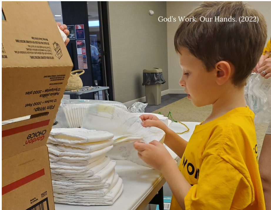
God's Work. Our Hands. (2022)