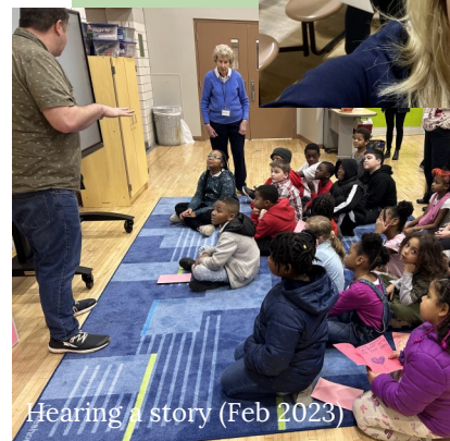
Hearing a story (Feb 2023)