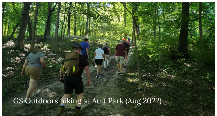
GS Outdoors hiking at Ault Park (Aug 2022)