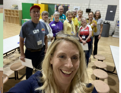
The crew in September 2022