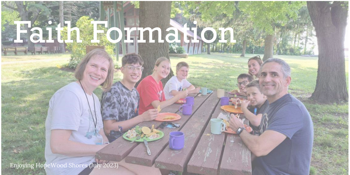
Enjoying HopeWood Shores (July 2023)