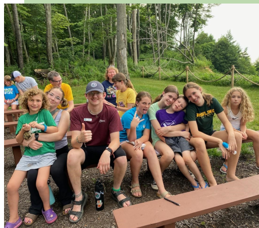
Fun at HopeWood Shores (July 2023)