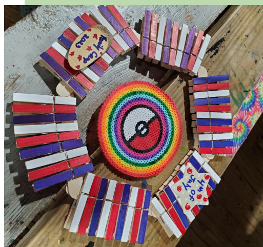
Camp Crafts (July 2023)