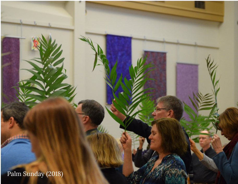
Palm Sunday (2018)