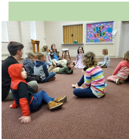
Kids Connect (March 2023)

April 30 | 9:30 am - "Here We Stand" Milestone (Pg 12)