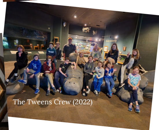
The Tweens Crew (2022)