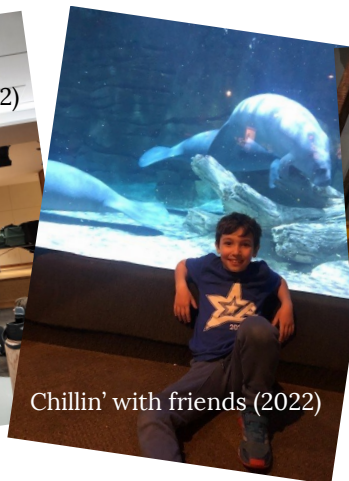
Chillin' with friends (2022)