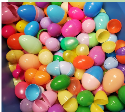
Getting ready for the Easter Egg Hunt!