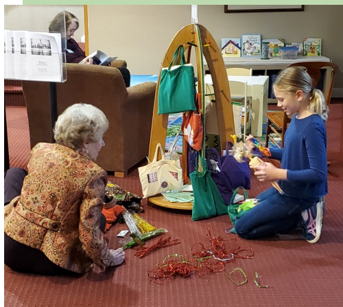
Stocking the worship toys (March 2023)