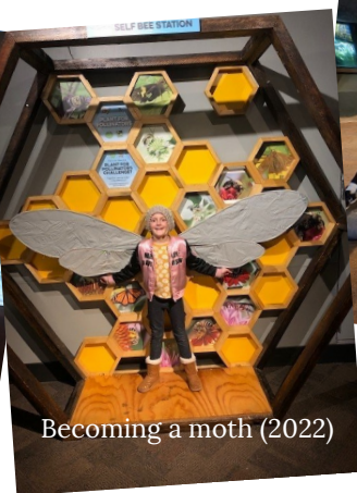
Becoming a moth (2022)