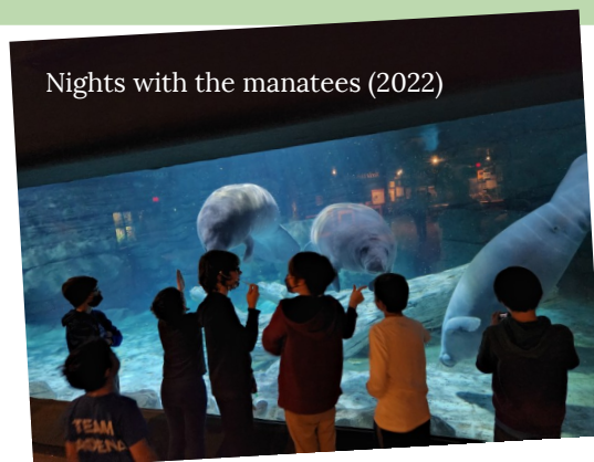
Nights with the manatees (2022)

You can register for the event at onrealm.org .