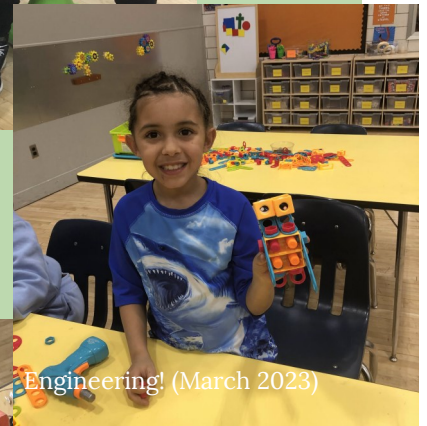
Engineering! (March 2023)