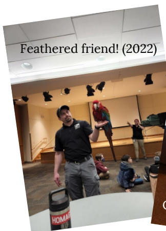
Feathered friend! (2022)