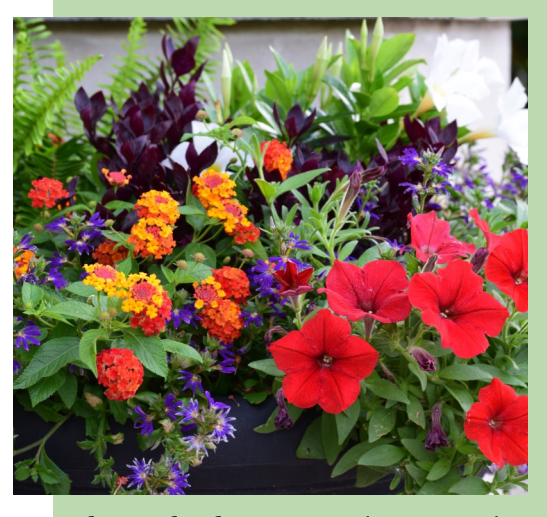
Flowers by the entrance (June 2023)