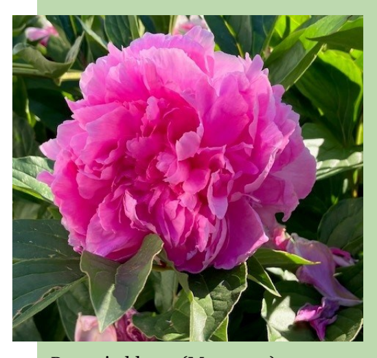
Peony in bloom (May 2023)