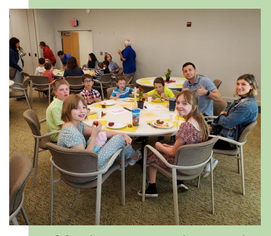
Celebrating GS Connect (May 2023)