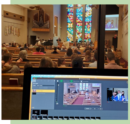
View from the A/V Room (May 2023)

June 29 | 7 pm - Spoke Folk Concert (Pg 9)