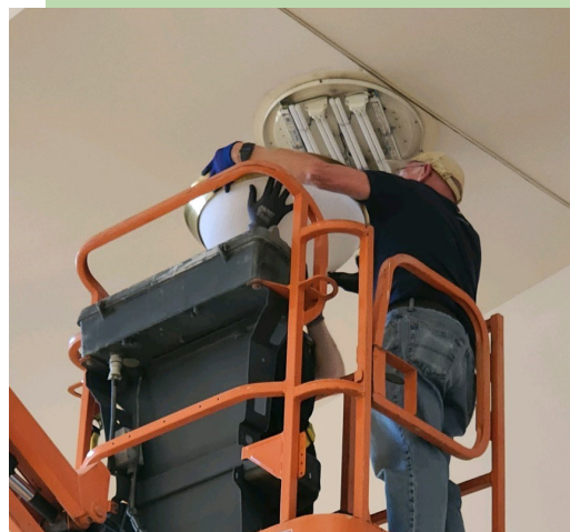
MMWC installing lights