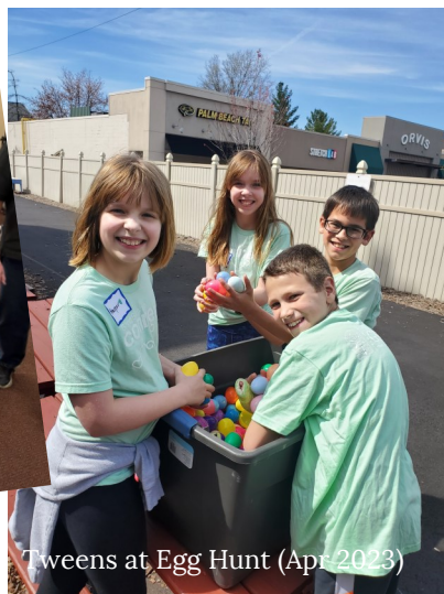
Tweens at Egg Hunt (Apr 2023)