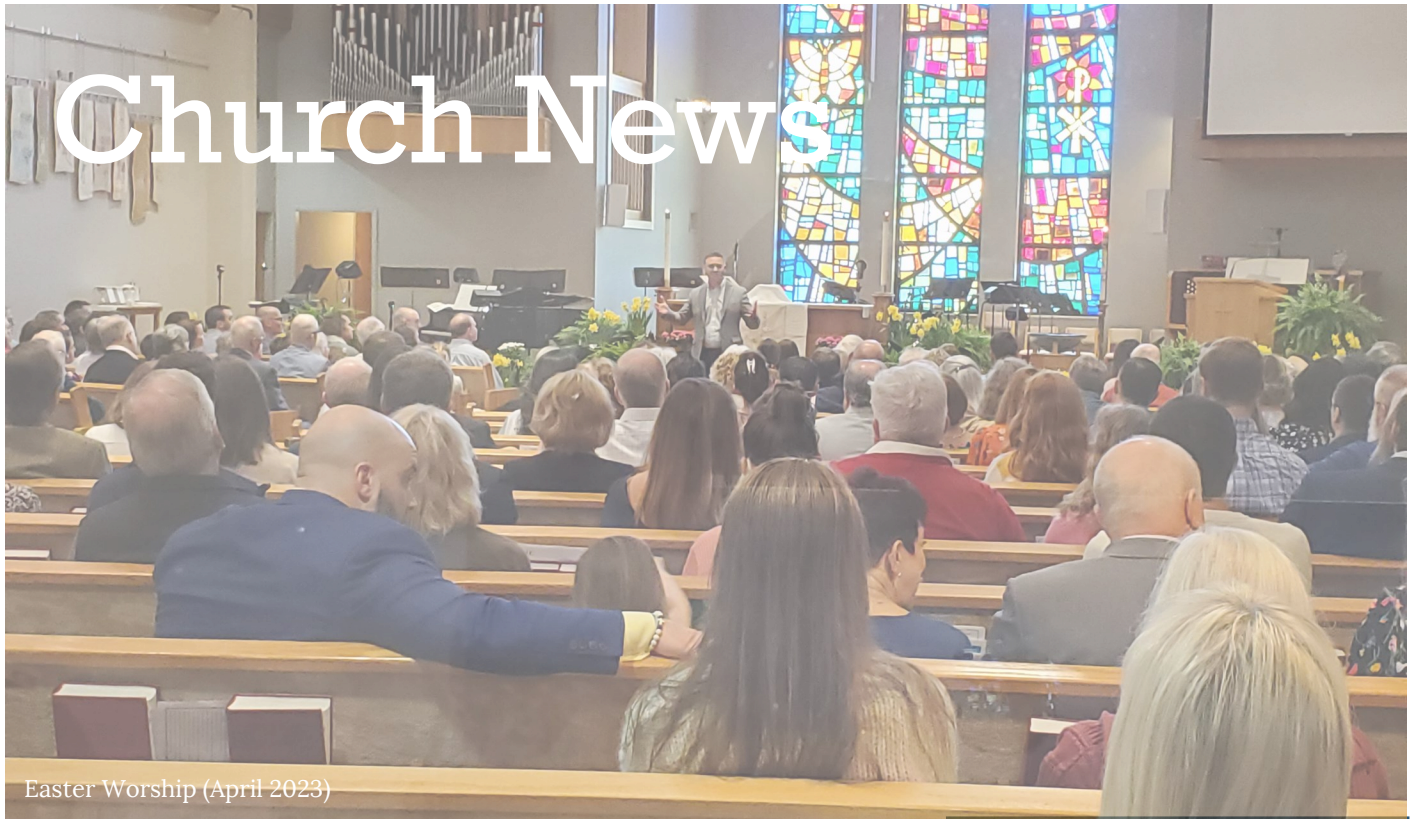
Easter Worship (April 2023)