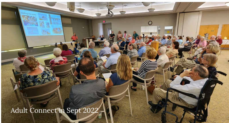
Adult Connect in Sept 2022

May 21st - Faith Formation Celebration. Join together as a community to celebrate another year of Faith Formation at Good Shepherd! We’ll enjoy a light breakfast and take time to recognize the volunteers who gave their time and talents to help us grow in our faith.