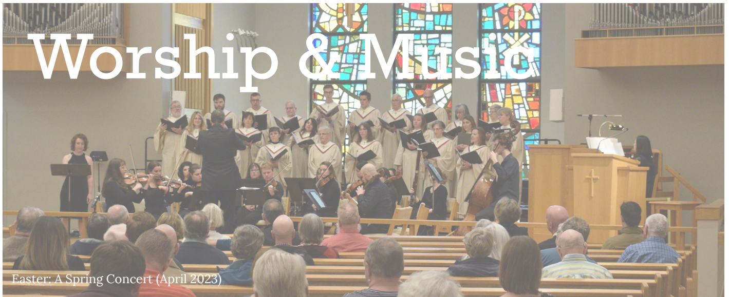
Easter: A Spring Concert (April 2023)