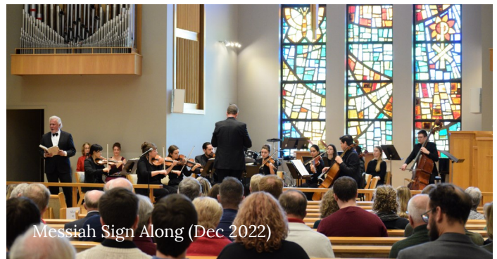
Messiah Sign Along (Dec 2022)