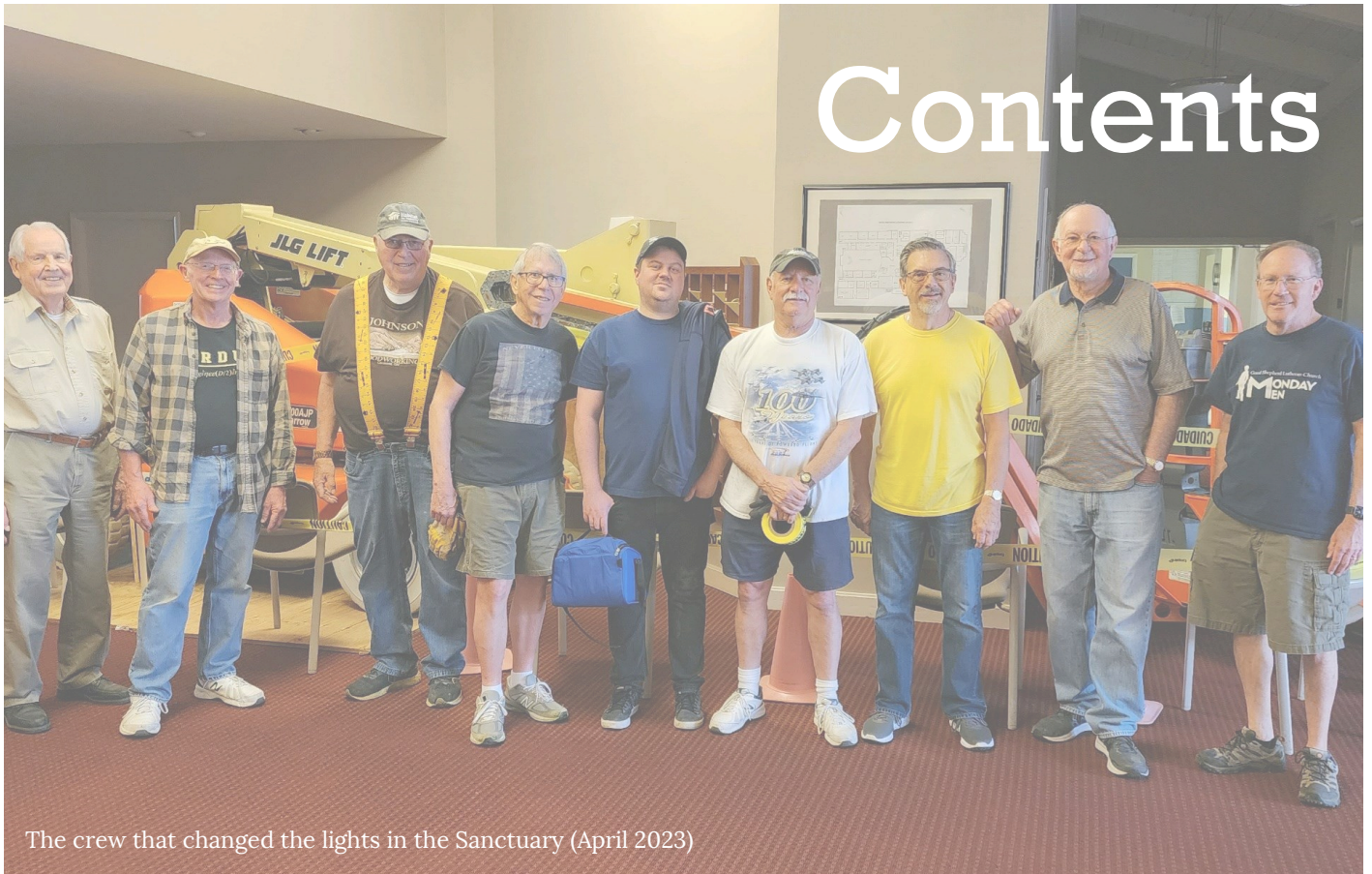
The crew that changed the lights in the Sanctuary (April 2023)