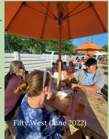
Fifty West (June 2022)