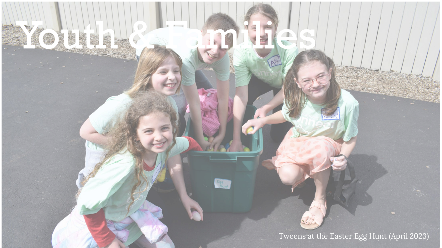
Tweens at the Easter Egg Hunt (April 2023)