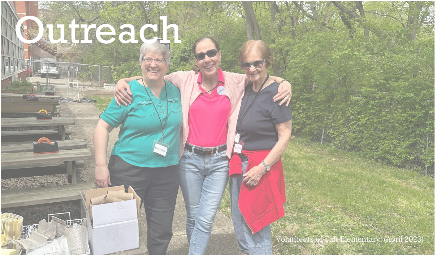
Volunteers of Taft Elementary! (April 2023)