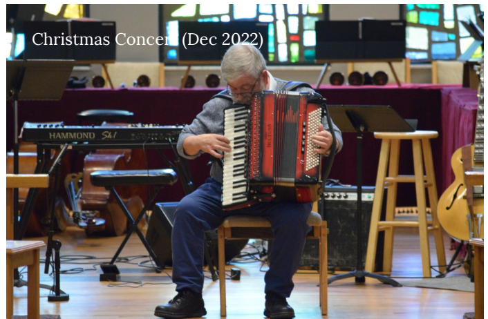
Christmas Concert (Dec 2022)