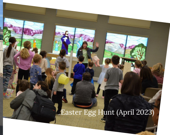
Easter Egg Hunt (April 2023)