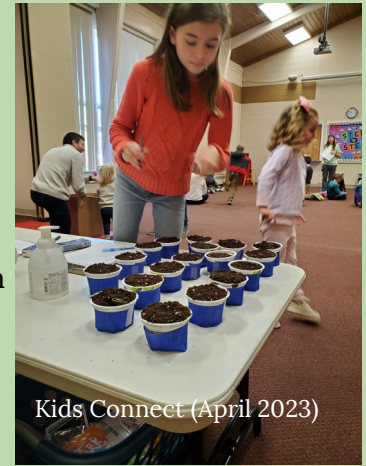
Kids Connect (April 2023)