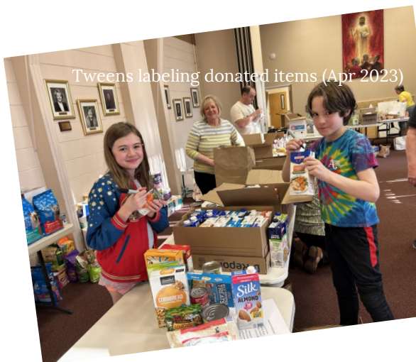
Tweens labeling donated items (Apr 2023)